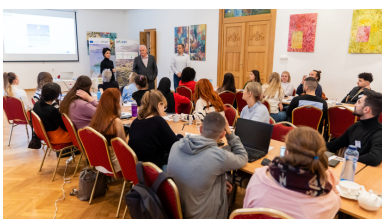
First days of Winter School. Student induction.

Check out the photos here and also on our social media!