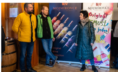
Final memorable moments of the Winter School.