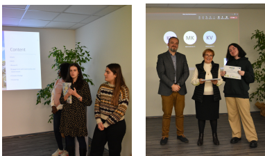
Winter school ceremony moments.