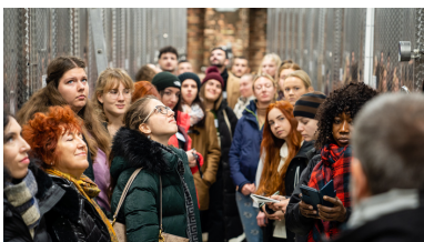
Students visited the Agrobiotech research center. There they had the opportunity to participate in the production of non-alcoholic beer, which they tasted at the award ceremony.