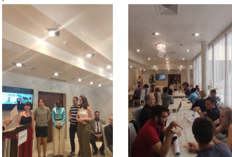
Summer school ceremony moments.