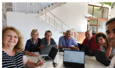
Invest speakers at work, preparing for the special sessions at the dedicated Trainer of the Trainers event.

Check out the photos here and also on our social media.