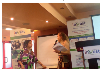
Student group project presentations.