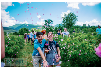
Student field trip, Damascena rose picking, an endemic product.